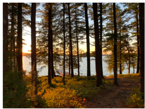
Pinus strobus , eastern white pines, Lake Winnepesaukee, New Hampshire

I hope this issue of the Dirt finds you well-rested and ready for another year of learning and