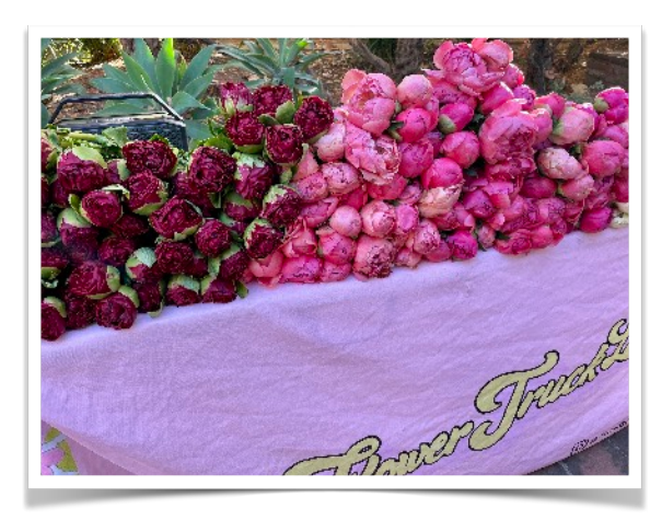
The Flower truck was at the Old Mill on Thursday, what a great event!

The California Art Club show "A Feast for the Eyes" is at the Old Mill now until January 21, 2024