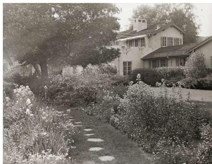
This is a glass slide from the Library of Congress of the house while still on Orange Grove Blvd.

This is their house at 1150 South Orange Grove in Pasadena.